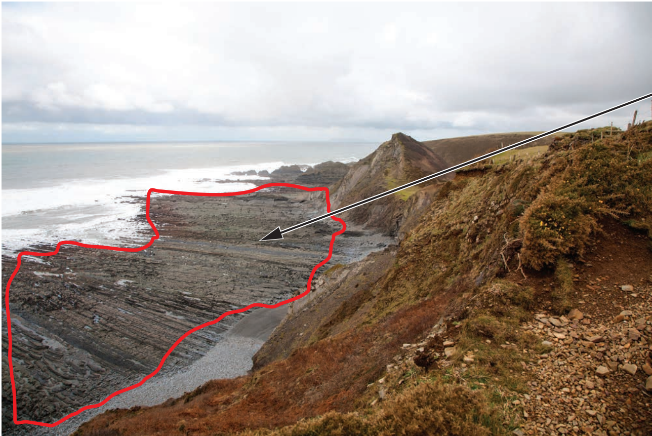
Fig. 1 – A coastal landscape in England