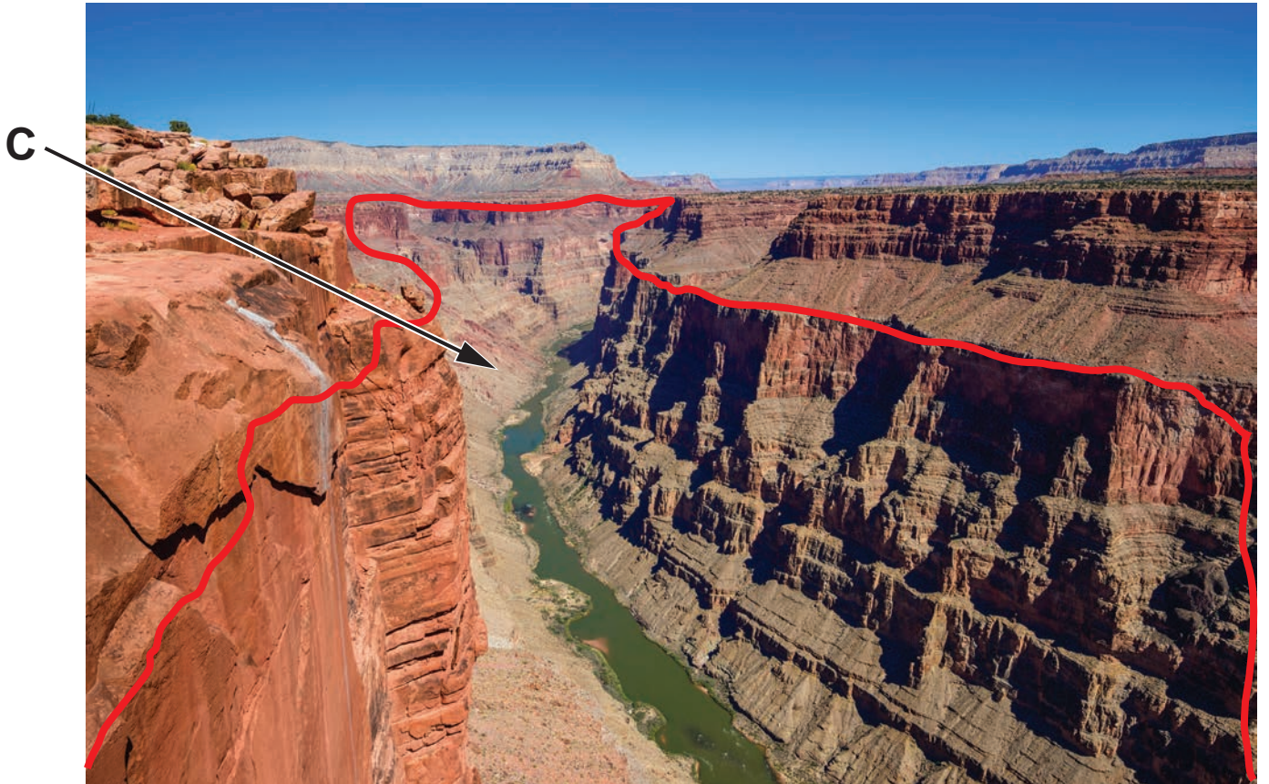
Fig. 3 – A dryland landscape in the USA