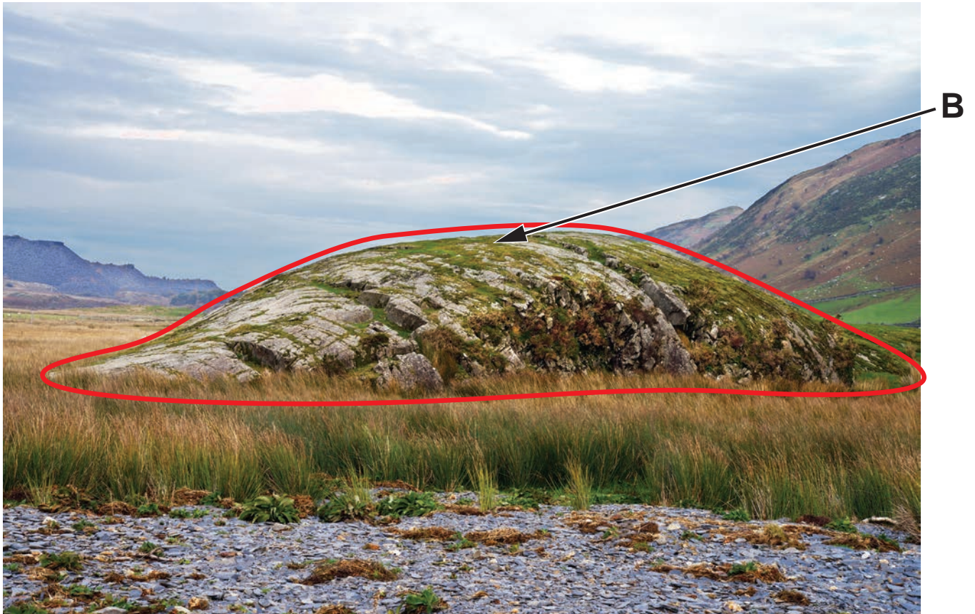
Fig. 2 – A glaciated landscape in England